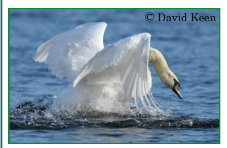
Mute Swan, KLNR, November 2018

It is now late January, which seems a long time since the long hot days of summer 2018 when the lake and surrounding fields were alive with activity. There were young birds on the water and in the sky all making the best of the weather; there were swifts, swallows, sand martins and house martins but although all four species could be seen there did not seem to be the same numbers as we have seen in the past or was it the presence of the hobbies which are quite capable of taking them in flight that was keeping them away?