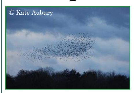
Starlings Murmurating at KLNR, January 2019

One of the biggest wildlife spectacles that we play host to on our reserves is that of murmurating starlings winter. Nearly every year large numbers of these birds gather to roost in the reed beds at the lake every evening from November onwards and perform their incredible aerial ballet. so reminiscent of shoaling fish, as the sun sets over the water. It is eagerly anticipated by those in the know and there was huge disappointment last year when the starlings failed to turn up (Ed: interestingly our bird