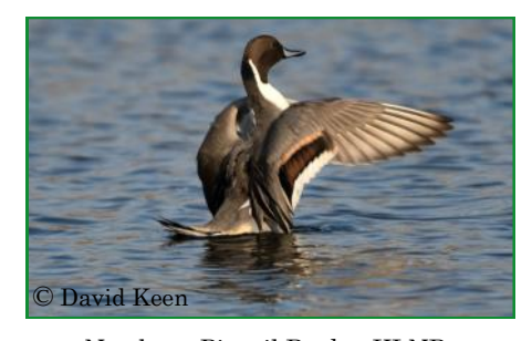
Northern Pintail Drake, KLNR, November 2018

Hopefully it will not be long now and we will see the oystercatchers and great crested grebes return to the lake; this will trigger the start of a new season and with five swans on the lake at the moment we could have a breeding pair to watch but it is early days and we have not finished with the winter yet and there could still be lots to see! Kemerton is fast becoming the place to visit not only in the summer but the winter as well.