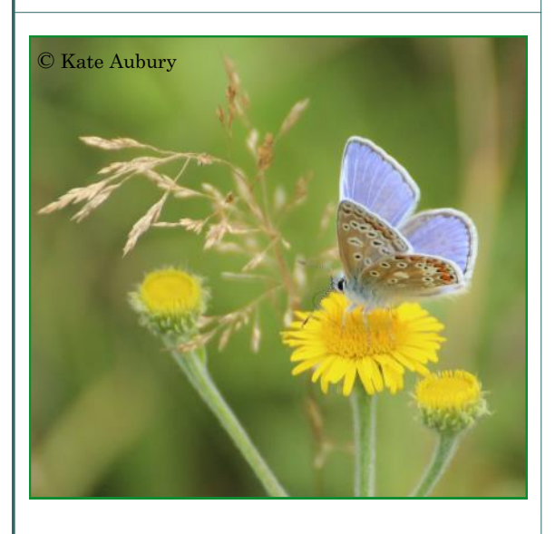
\begin{array}{c} {\rm Male\ Common\ Blue\ } Polyommatus\ Icarus\ {\rm on} \\ {\rm Common\ Fleabane,\ Beggar\ Boys\ Wetland,} \\ {\rm August\ } 2018 \end{array}

For more information on the work of KCT please visit our website: www.kemerton.org