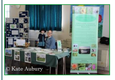
KCT volunteers manning the stand, KOW Apple Day, October 2018

On Saturday 13th October it was Kemerton Orchard Workers' Annual Apple Day at Victoria Hall and the Trust was there to support our sister organisation. KOW manages Daffurn's Orchard in Kemerton for the local community and the annual Apple Day is their main fundraising event.