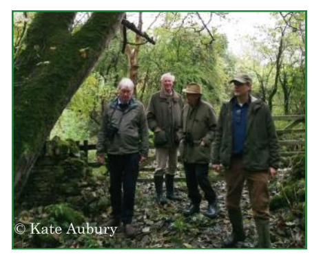
KCT Governors in Aldwick Wood, October 2018

After reviewing the past year, the governors identified their priorities for 2019; raising funds for part-time staff, continuing work with CCARP and focusing on invertebrate projects on Bredon Hill. We will also look at the feasibility of purchasing