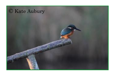
\begin{array}{c} {\rm King fisher\ on\ perch,\ KLNR,} \\ {\rm November\ 2018} \end{array}

Visitors to the hide may spot this flashy female at any time but if you are hoping to photograph her heading down early is your best bet. She often arrives just after dawn for her breakfast and will use several of the perches as the